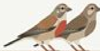
Bluthänfling Carduelis cannabina