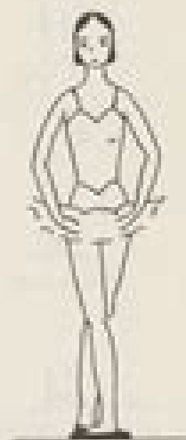
Fifth position en bas of the arms (with the feet in the fifth position).