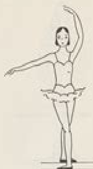
Fourth position en haut of the arms (with the feet in the fourth position croisé).