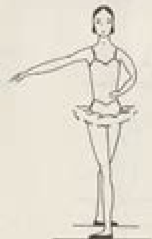
Fourth position en avant of the arms (with the feet in the fourth position croisé).