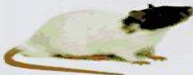
RATS & MICE

A FAMILY GUIDE TO BUYING, CARING FOR, AND BREEDING SMALL PETS