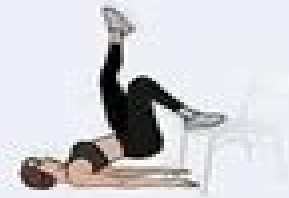
Adductor raises 3x15