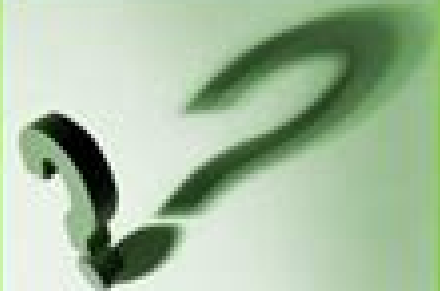
Second Modernity Theories