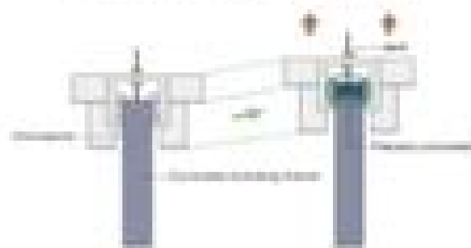
VERTICAL SLIP FORM

In vertical slip forming, the concrete form may be surrounded by a platform on which workers stand, placing steel reinforcing rods into the concrete and ensuring a smooth pour. Together, the concrete form and working platform are raised by means of hydraulic jacks. Generally, the slip-form rises at a rate which permits the concrete to harden by the time it emerges from the bottom of the form.