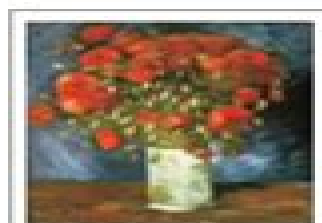
VAN GOGH Poppies