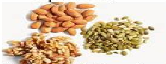
Nuts and Seeds