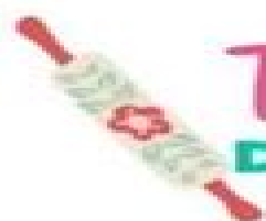
Tableau de conversion DES MESURES & TEMPÉRATURES