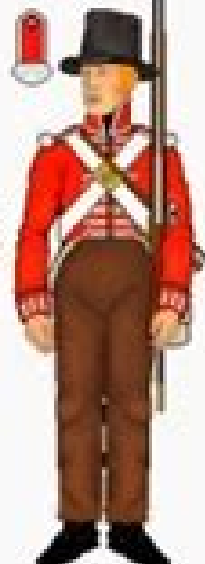
milicien en uniforme du 41st foot durant la campagne de Detroit