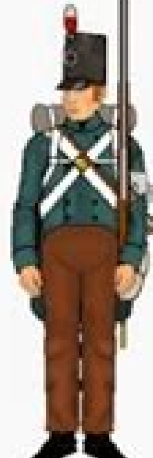
compagnie de flanc du 3rd York