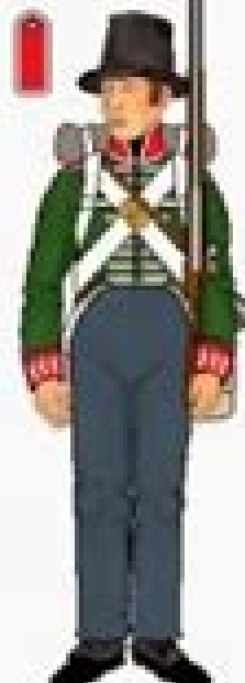
milicien en costee vert, en plus de la milice incorporée, certains miliciens purent bénéficier des mêmes uniformes