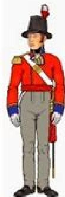
officier de milice