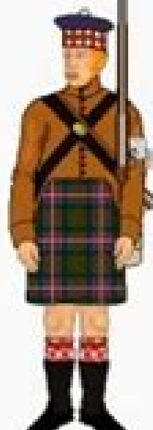
milicien des comtés de Dundas ou Glengarry en tenue écossaise traditionnelle