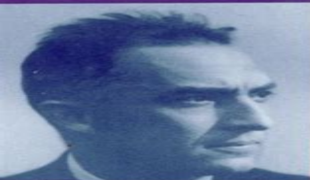
WILLIAM CARLOS WILLIAMS