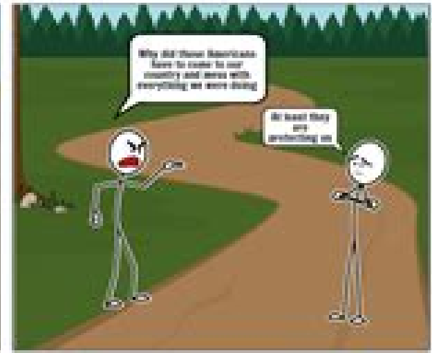
Protectorate is where the mother country protects its states as well as territories.