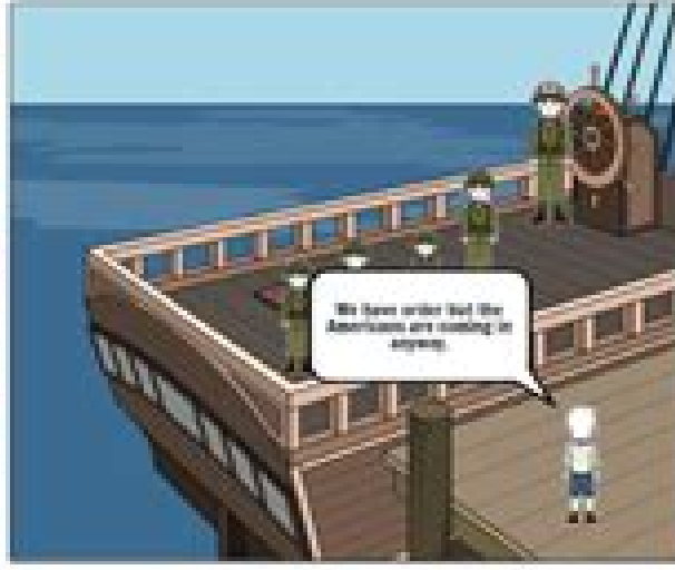
The Platt Amendment only allowed the Americans to interfere if there was chaos in Cuba. They invaded anyway.