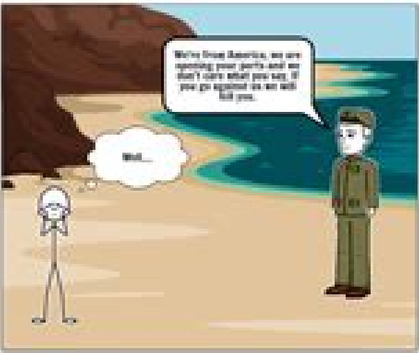
Open Door Policy made it so that America could open the ports of other countries to allow trade with the Chinese in this case.