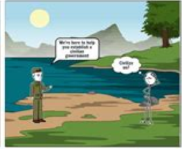
Foraker Act made the first 'civil' government in Puerto Rico.