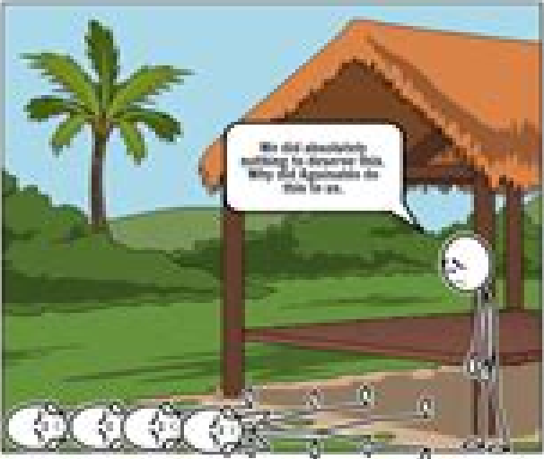
American Filipino war