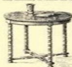
FIG. 21.—Sketch of circular table.

The Top can either be cut from solid material and rounded on both sides or laminated, viz. loosely material can be adapted, in which case it is only necessary to round the top side.