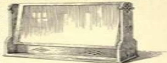
FIG. 5.—A wing chair section.

The Top can either be cut from solid material and rounded on both sides or laminated, viz. loosely material can be adapted, in which case it is only necessary to round the top side.