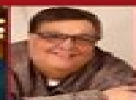
BIG MO & FAMILY