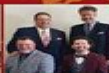
FORT CITY QUARTET