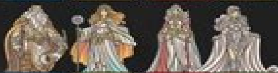
DEDEKHOZ LADA ZORYA MOKOSH