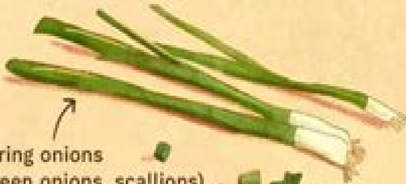
Spring onions (green onions, scallions)