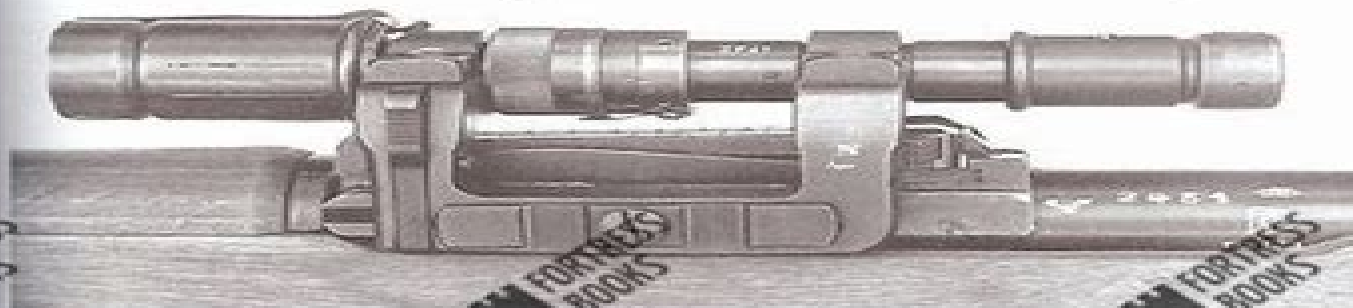
Abb. 1.25 Mauser: Linker und rechter Seitenansicht eines Gewehr 98k mit einem Fernglas. Das Gewehr 98k ist ein kürzeres Gewehr, das die gleiche Mechanik wie der Gewehr 98 hat, aber eine andere Form hat. Die Gewehr 98k ist ein Gewehr, das in der Zeit vor der Einführung des K 98k entwickelt wurde.