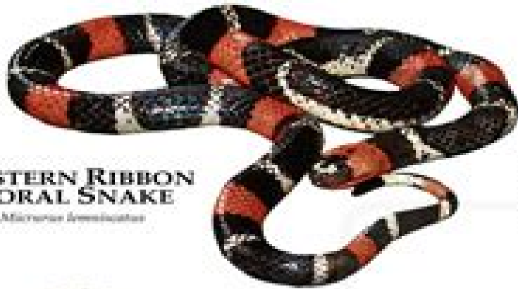
EASTERN RIBBON CORAL SNAKE