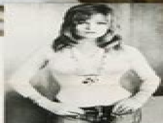
She collects heroes!