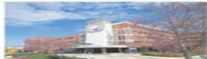
CarolinaEast has grown and learned a lot about viruses in dealing with COVID-19 over the past year.