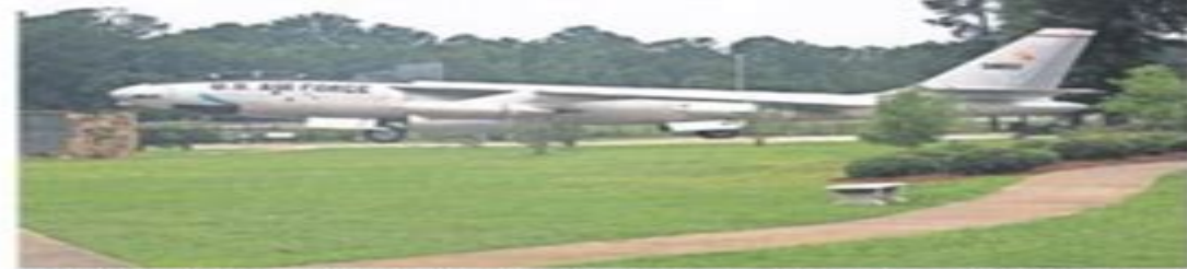
This B-47 bomber on display with the Mighty 8th Air Force Museum in Savannah is similar to the one that dropped an atom bomb near Florence, SC in 1958. Luckily its detonator was not installed its explosion was not nuclear. (Drew Beck)

The Carolina dance with death that happened in Goldsboro in 1966 wasn't the first. You recall our story of the nuclear bomb that dropped from a B-52 after it disintegrated in the air near Goldsboro? One bomb's chute opened, and it landed in a tree its nose just inches from the ground and its 6 of its 7 arming switches thrown, while its bomb bay mate buried itself 200 feet under the ground. That second bomb is still buried out there today, incapable of exploding but very much radioactive.