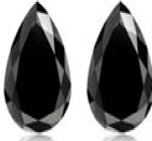
Treated Black Diamonds