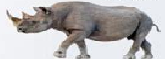
West African Black Rhinoceros