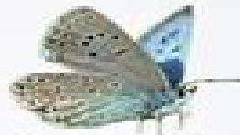
Dutch Alcon Blue Butterfly