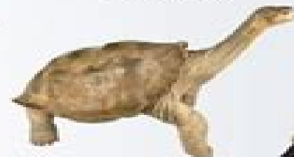
Pinta Island Tortoise