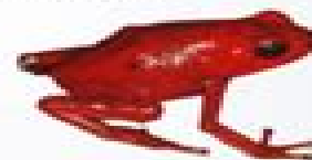
Splendid Poison Frog