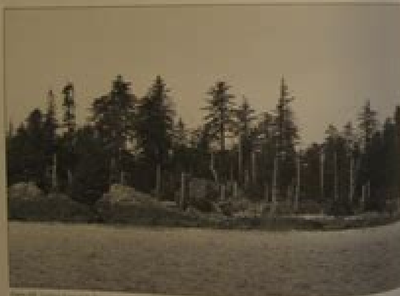
Figure 217. Adult Rhinoceros Auklet nesting along the shore of a forested area, Rhinoceros Auklet, May 1964, R. Wayne Campbell.