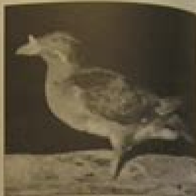
Figure 216. Adult Rhinoceros Auklet on United States Coast Guard Station.

CHANGING TO STATUS: In the case of U.S. Marine and Coast Guard, the Rhinoceros Auklet was considered a common species until the mid 1950s when it was listed as a rare species. In the mid 1950s, several breeding colonies had been discovered (see 1955, 1956, 1957, 1958, and 1959). Since then, several colonies have been discovered since the late 1950s, the species has expanded its breeding range south into Oregon and California. From 1959 to 1964, it was listed as a common species. In 1964, it was listed as a common species. The status of the species was changed to a common species in 1964. This change was due to the increasing number of reports received as well as changing environmental conditions and changes in past species distribution (see 1964, 1965).