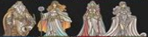
DEDEKHOZ LADA ZORYA MOKOSH