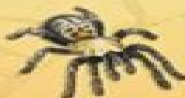
hairy bird-eating spider