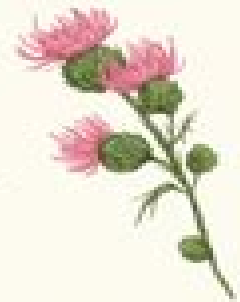
milk thistle/ tea