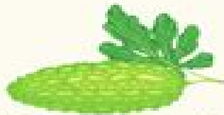
bitter gourd /melon