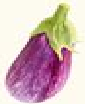
aubergine/ egg plant