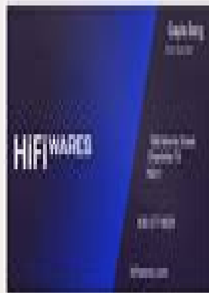
STANDARD 3.5" x 2"