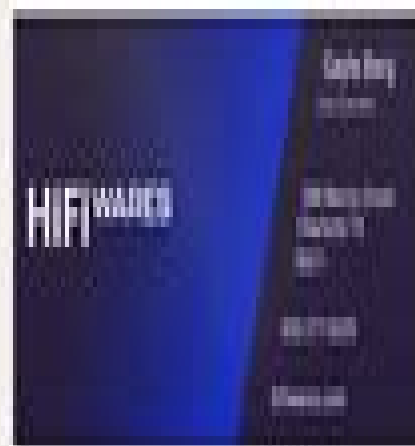
SLIM 3.5" x 1.75"