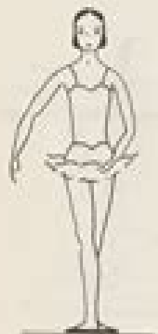
Third position of the arms (and feet).