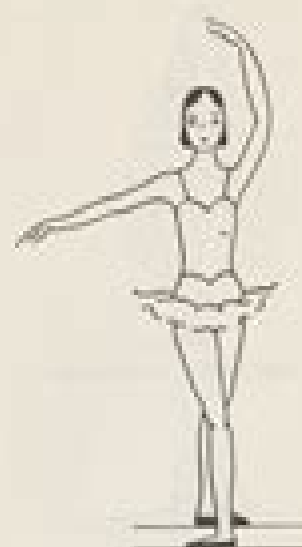
Fourth position en haut of the arms (with the feet in the fourth position croisé).