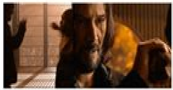
Cut on Action