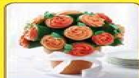
CUPCAKES TO WOW!