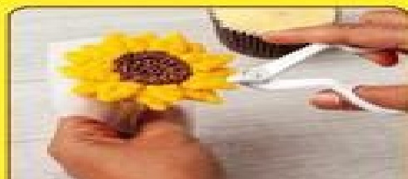
SIMPLY STUNNING FLORAL IDEAS