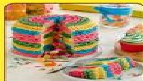
QUICK CELEBRATION CAKES