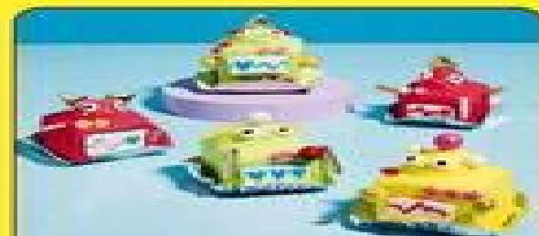
CUTE FONDANT PARTY TREATS