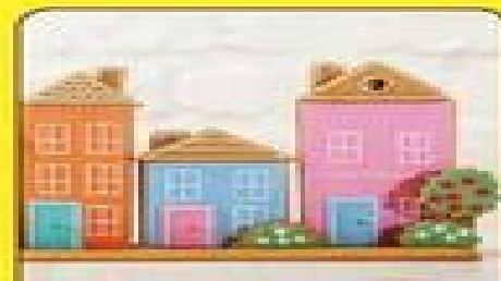
SWEET ICED TREATS