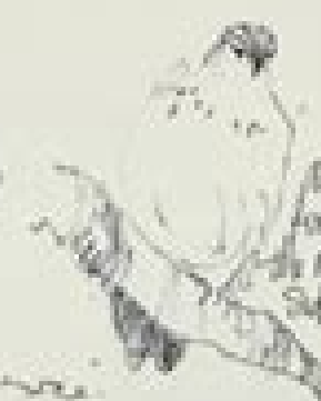
Another hawk for the area the road Sul Clunk PARK