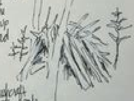
Backwards but in the middle