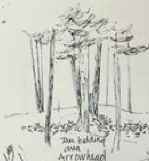
San holding area Arrowhead