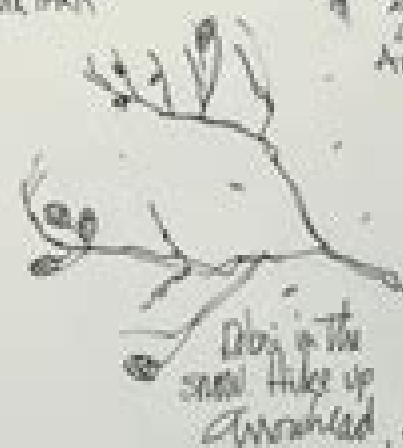
Down in the snow. Hike up Arrowhead