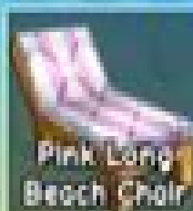
Pink Long Beach Chair