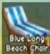
Blue Long Beach Chair