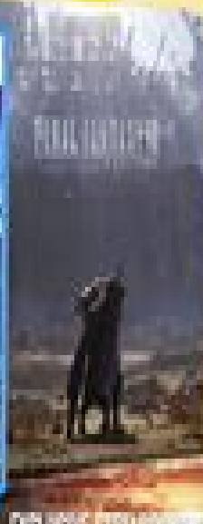
EXCLUSIVE MIDGAR BANGLE