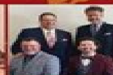
FORT CITY QUARTET