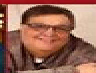
BIG MO & FAMILY