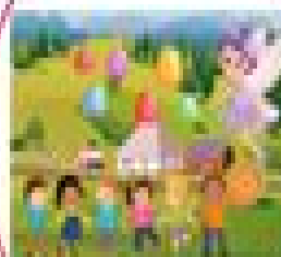
The Great Adventure of the Bubblegum Fairy