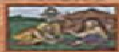
These amazing hunters are hunting for the most delicious food in the land.