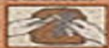
These amazing hunters are hunting for the most delicious food in the land.