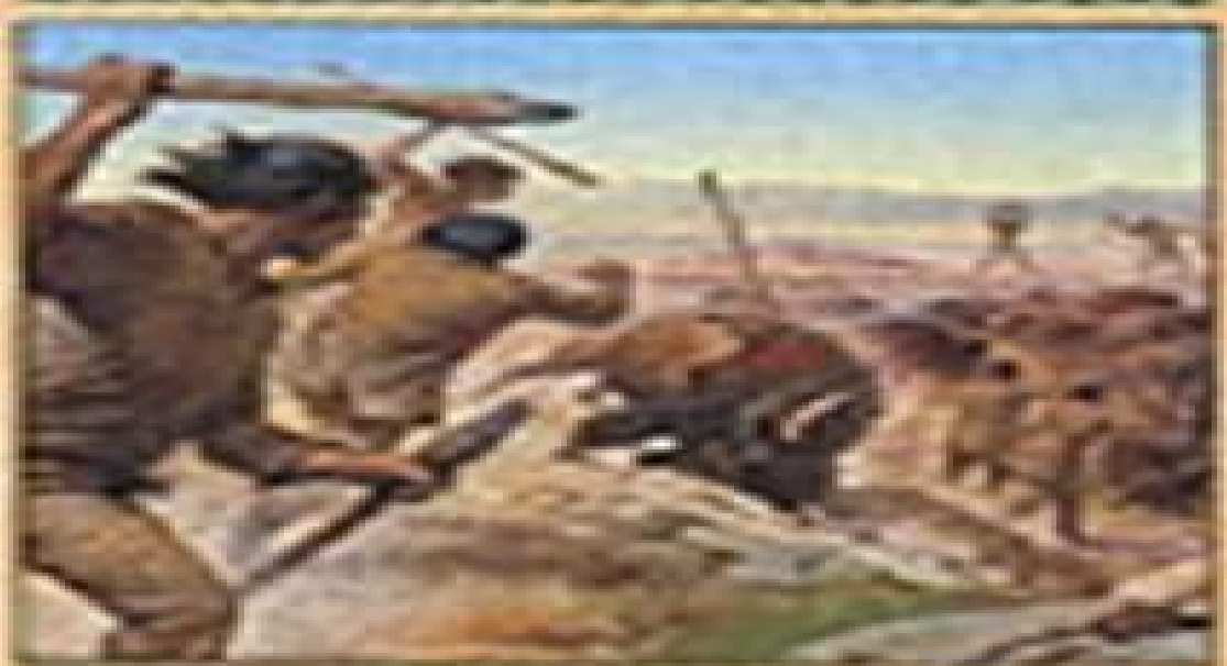
These amazing hunters are hunting for the most delicious food in the land. They are the best hunters in the world.