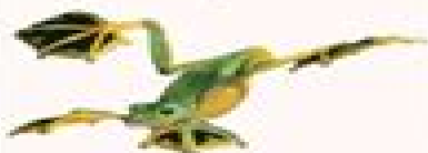
Wallace's Flying Frog