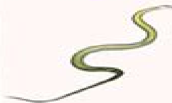
Paradise Tree Snake