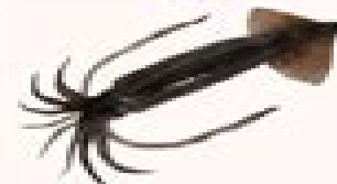
Japanese Flying Squid