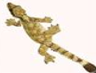
Kuhl's Parachute Gecko