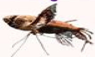
Freshwater Butterfly Fish