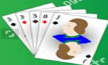
THREE OF A KIND