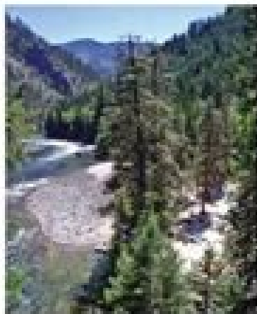
Looking upstream toward Tango Creek Rapid over Tango Bar Camp

Start at the bottom! That means from bottom to top on all map pages following the river's flow!