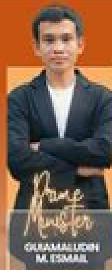
Prime Minister USAMAHUDDIN M. ESMAEL