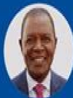
H.E. Njuguna Ndung'u Cabinet Secretary, National Treasury and Economic Planning, Republic of Kenya