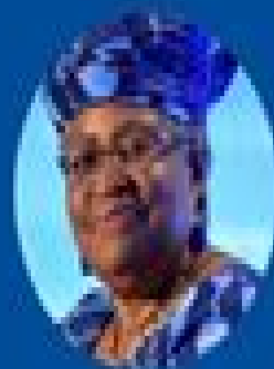
Dr. Ngozi Okonjo Iweala Director-General, World Trade Organization