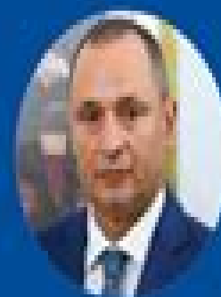
H.E. Ryad Mezzour Minister of Industry and Trade, Kingdom of Morocco