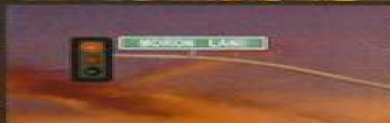
Redlight Runner stupidus colorblindus