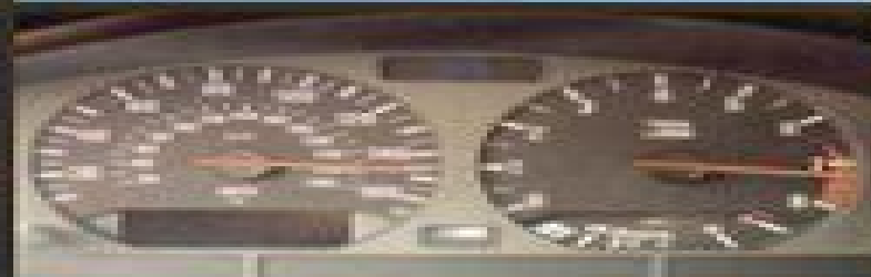
Leadfooted Imbecile licensus suspensus

Few places on earth can rival the road for the sheer multitude of morons to be found there. Packed with hundreds of photographs, maps, and illustrations, this book will enable you to identify each species of moron before they crash into you.