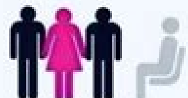
The cuckold threesome