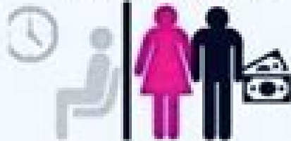
The escort wife