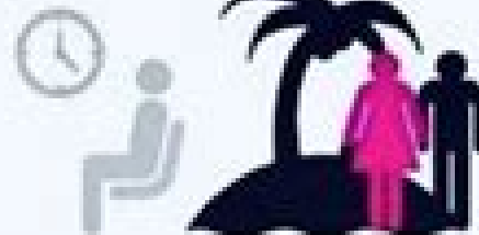
Wife on vacation with her lover