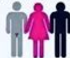
The chastity cuckold