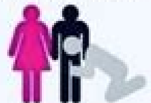
The bisex cuckold