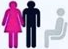
The voyeur cuckold