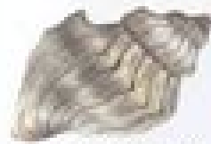
Frilled Dogwhelk (W)

Collispira ligata To 1 in. (2.5 cm) high Pearl-shell, strongly ridged shell is as wide as it is high.