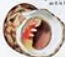
Bleeding Tooth (CB)

Hydrobia ulitiformis To 1 in. (2.5 cm) Brown to white shell has body seal frills and spines. Species found in aquatic waters have smoother shells. Found in intertidal waters.