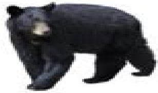
American Black Bear