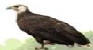
Madagascar Fish Eagle