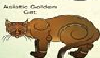
Asiatic Golden Cat