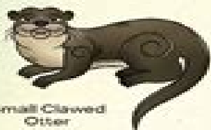
Small Clawed Otter