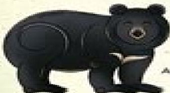
Asiatic Black Bear