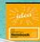
Unglaublicher Stift & Zauber-Notizblock