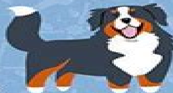
Bernese Mountain Dog