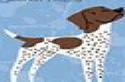
German Shorthaired Pointer