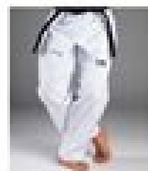
꼬아 서기 Kkoa Seogi

Literally, Front Flexible aka Long Stance