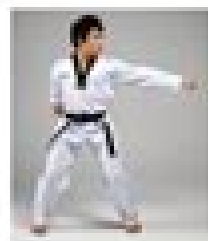
옆 지르기 Yeop Jireugi