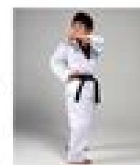
뒤 지르기 Dwi Jireugi