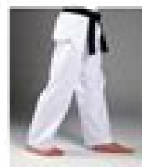
앞 서기 Ap Seogi

Literally, Front Stance aka Walking Stance