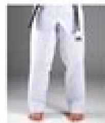
나란히 서기 Narani Seogi

Literally, Gathered Stance aka Closed Stance