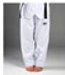
모아 서기 Moa Seogi

Literally, Gathered Stance aka Closed Stance