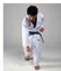
내려 지르기 Nae-ryeo Jireugi