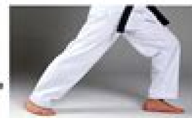
앞 굽어 Ap Gubi

Literally, Front Stance aka Walking Stance