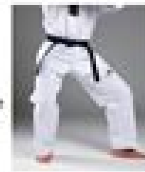
뒤 굽어 Dwi Gubi

Literally, Sider-by-side Stance aka Parallel Stance