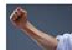
바깥 팔목 Bakkat Palmok