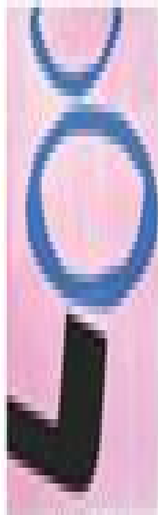
Look no one goes