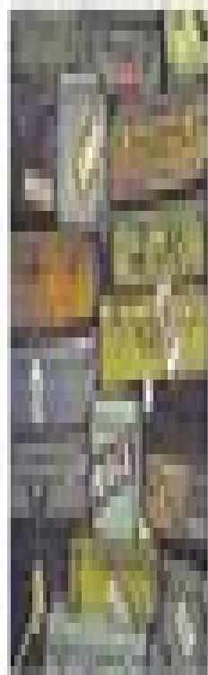
The bookcase in my room